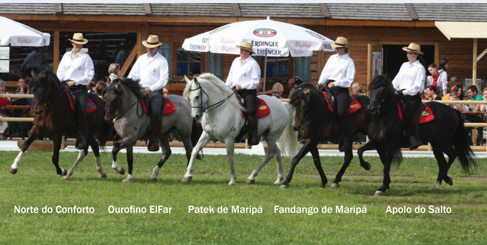
Norte do Conforto